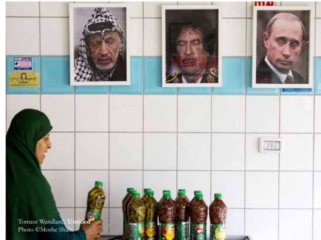
Tomasz Wendland. Untitled