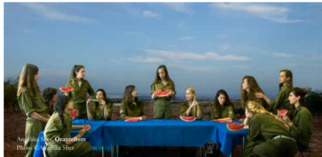
Angelika Sher. Orantellism Photo ©Angelika Sher

any restraint, is filmed jumping, crying and lamenting to the ticking of a metronome. An audible voice, which at first sounds annoying but later evokes identification, expresses the pain engendered in the artist's generation by tragic reality saturated with violence and war, a reality lacking in security and hope. From Misgav the journey leads viewers to the cities of Sakhnin and Arraba and ends in the village of Deir Hanna overlooking the open Galilean landscape. Each venue offers a display of a variety of art works with an emphasis on video and photography works that could give a viewer stomach cramps. These are artworks that do not beautify or flatter. They are exhibited in alternative and rough spaces, making the whole biennale an installation in itself.