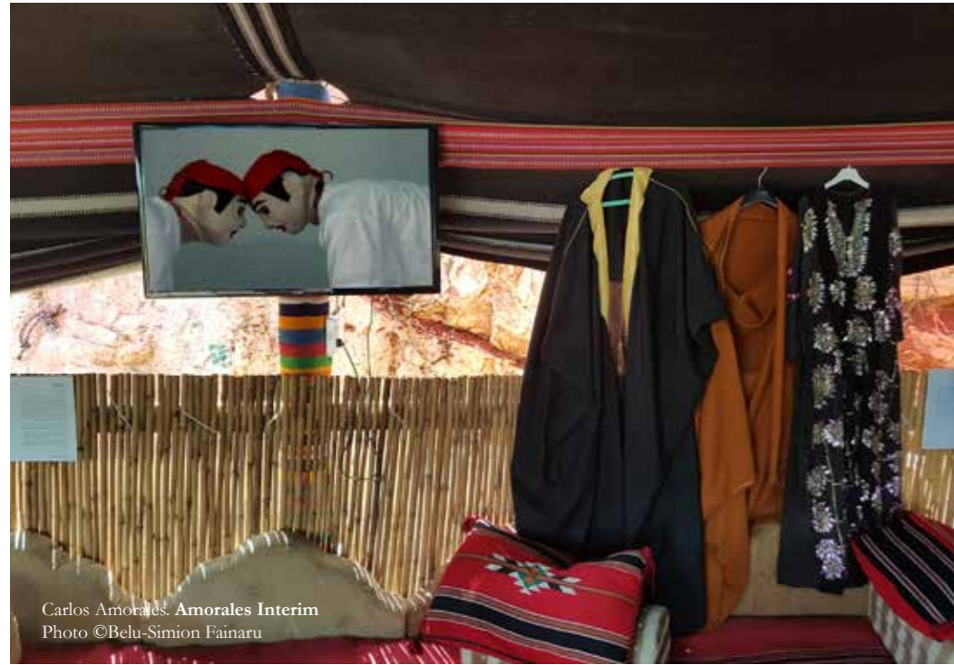
Carlos Amorales. Amorales Interim