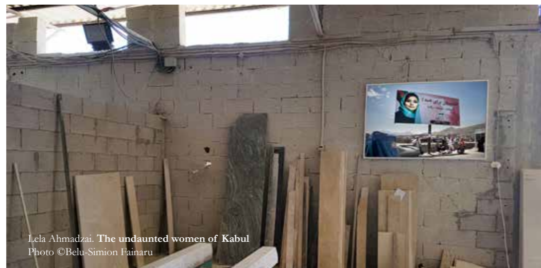
Lela Ahmadzai. The undaunted women of Kabul

Avital Bar-Shay Co-Director: "The event seeks to break the conventional curatorial rules. One of the main